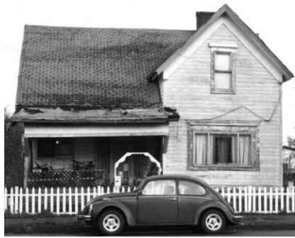
639 3 rd Ave SE : Before