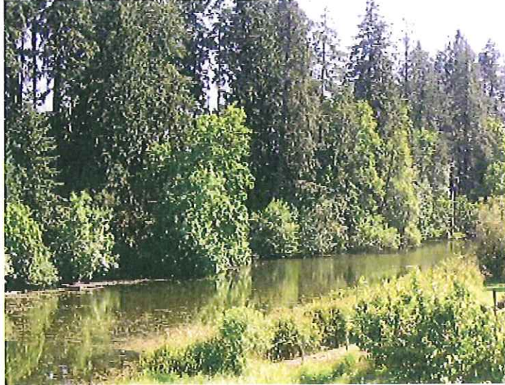
East Thornton Lake north end, midsummer