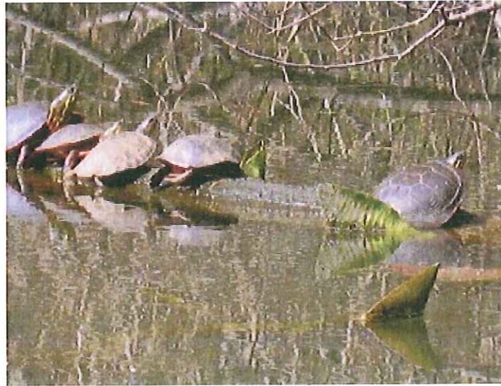
Albany's Thornton Lake is home to a rare combination of native turtles: Western Pond Turtle (center, 3rd) seen here with Western Painted Turtles, East Thornton Lake. Both species of native turtles are on Oregon's Sensitive-Critical list, and are Federal Endangered species in neighboring states.