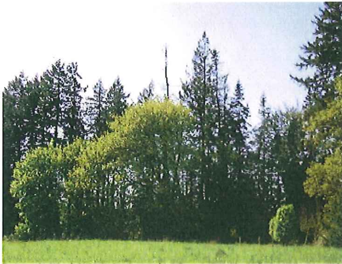
Site in the springtime