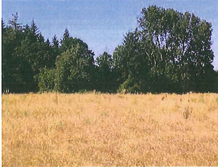
Proposed East Thornton Lake Natural Area