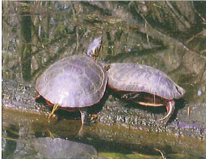
Western Painted Turtles, East Thornton Lake