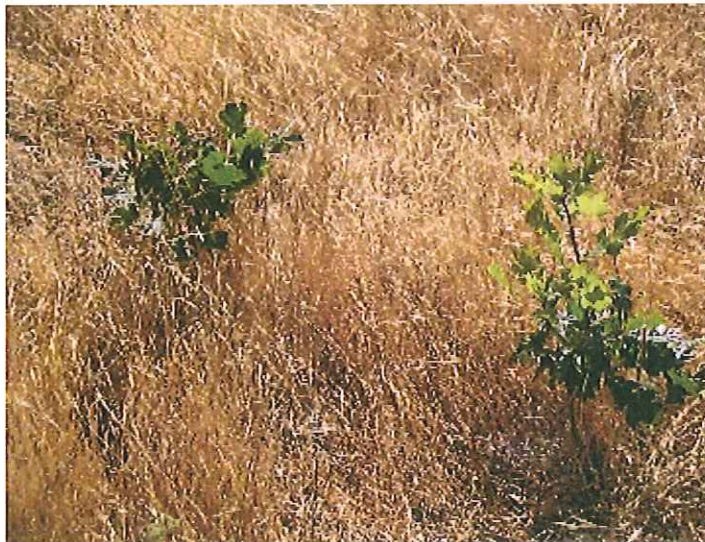
Oregon White Oak ( Quercus garryana ) volunteer seedlings have already begun to regenerate upland area of proposed East Thornton Lake Natural Area