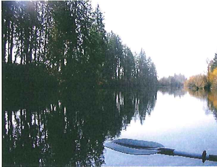
East Thornton Lake, Fall