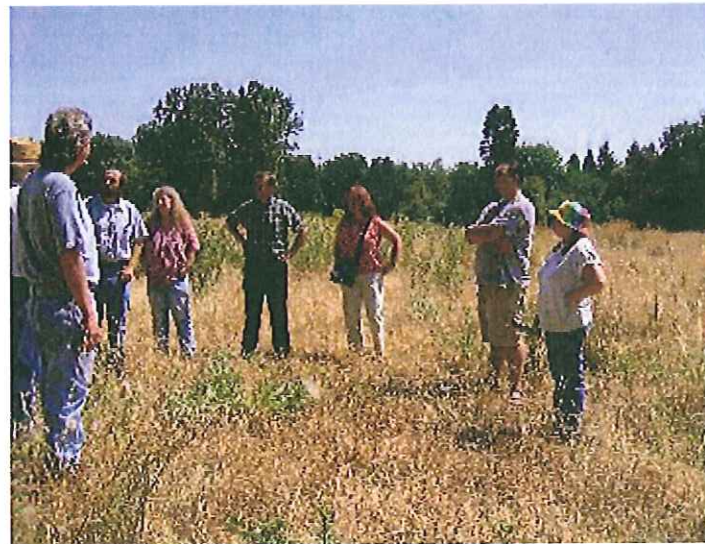
The City of Albany, watershed councils, tribal, educational and natural resource representatives met for a series of meetings and field trips over the summer to discuss the potential of East Thornton Lake Natural Area & Park.