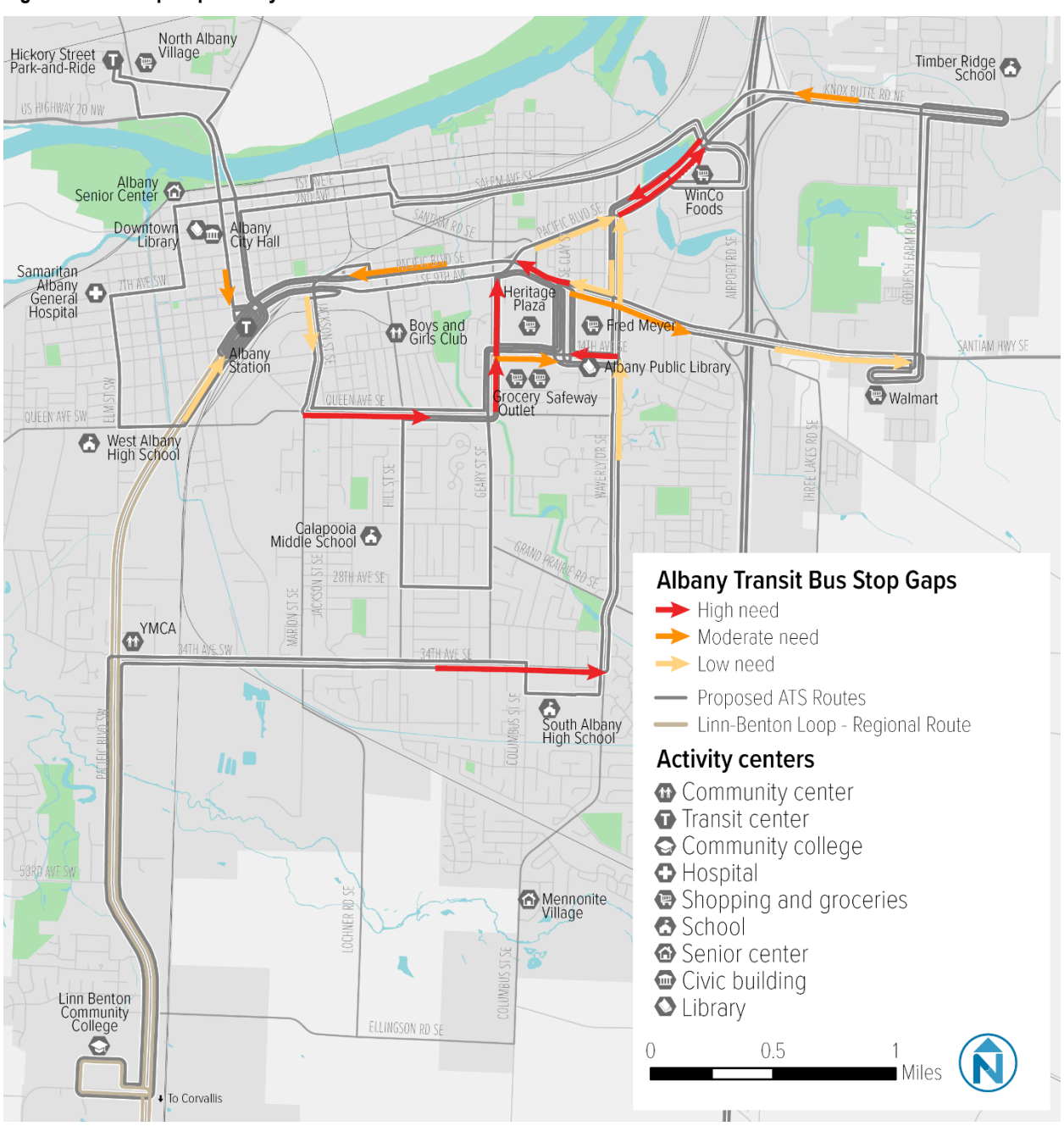
Figure 6: Bus Stop Gap Priority

If the yellow stops are unable to be built before the new service begins, there are several road segments that will be missing stops on one or both sides of the street. These gaps limit the functionality of the system and create barriers to accessing transit service. The project team prioritized the gap segments based on their importance to system functionality as well as the nearby land uses and community demographics. Segments that are critical for long term system performance, or those likely to see the greatest transit demand ranked highest (Figure 6). ATS will pursue construction of the bus stops in the "high need" segments within six months of starting service, and the remaining stops within two years.