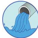
Sewer & Stormwater