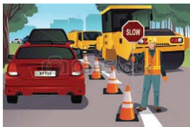
Street, Sidewalk and Bridge Construction and Maintenance