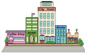
Business Recruitment and Retention